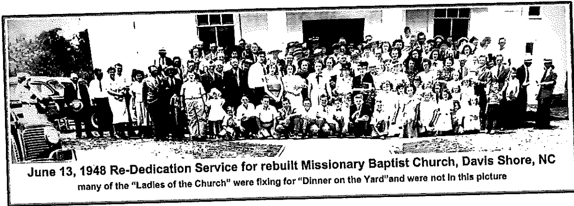
June 13, 1948 Re-Dedication Service for rebuilt Missionary Baptist Church, Davis Shore, NC many of the "Ladies of the Church" were fixing for "Dinner on the Yard" and were not in this picture

In 1962-63, the education building was added to the back, the entire facility was bricked and the baptistery installed.